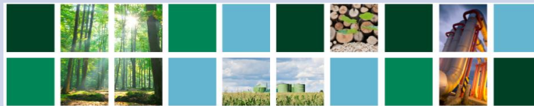
Renewable Heat Incentive (RHI)

A simple (£20bn) financial incentive scheme