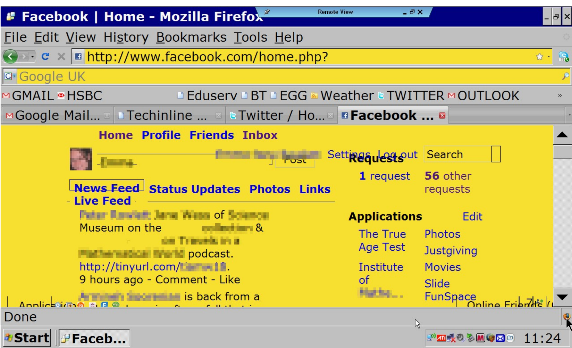
Image: Screen view of 32" desktop (Facebook Newsfeed, 2009), with custom CSS and drivers applied